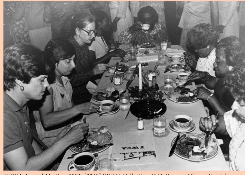
YWCA Annual Meeting, 1981. [0240]

In 1971, all activities and programs of the two branches of the YWCA finally came together under one roof at 185 South French Broad Avenue. Today, the YWCA is a thriving community center where people of all backgrounds feel welcome.