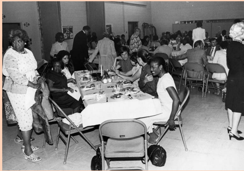
Annual Meeting in Multi-Purpose Room, 1981.

From the 1970s through the 1990s, the YWCA on South French Broad Avenue served thousands of children, teens and women through a wide range of activities. From bellydancing classes to breast cancer support groups, and from summer day camps to Friday night teen dances, the YWCA