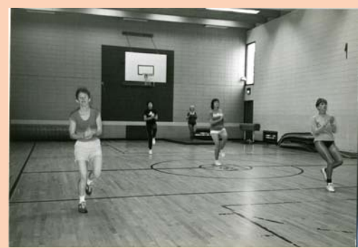
Gymnasium, 1980s. [0101]

From 1962 -1967, 185 South French Broad Avenue served as the Black YWCA branch. In 1967, the YWCA associations officially became one on paper. Thus, from 1968 -1970, both Whites and Blacks participated in activities at South French Broad. In 1971, when the Grove Street location closed due to financial difficulties, the physical integration of the YWCA of Asheville was complete. All