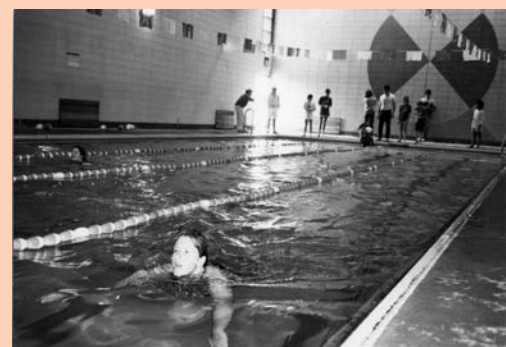
Pool, 1980s. [0304]

YWCA services were combined at South French Broad, the newer facility. It should be noted that at the time of the merger, Whites were already using the South French Broad facility in significant numbers.