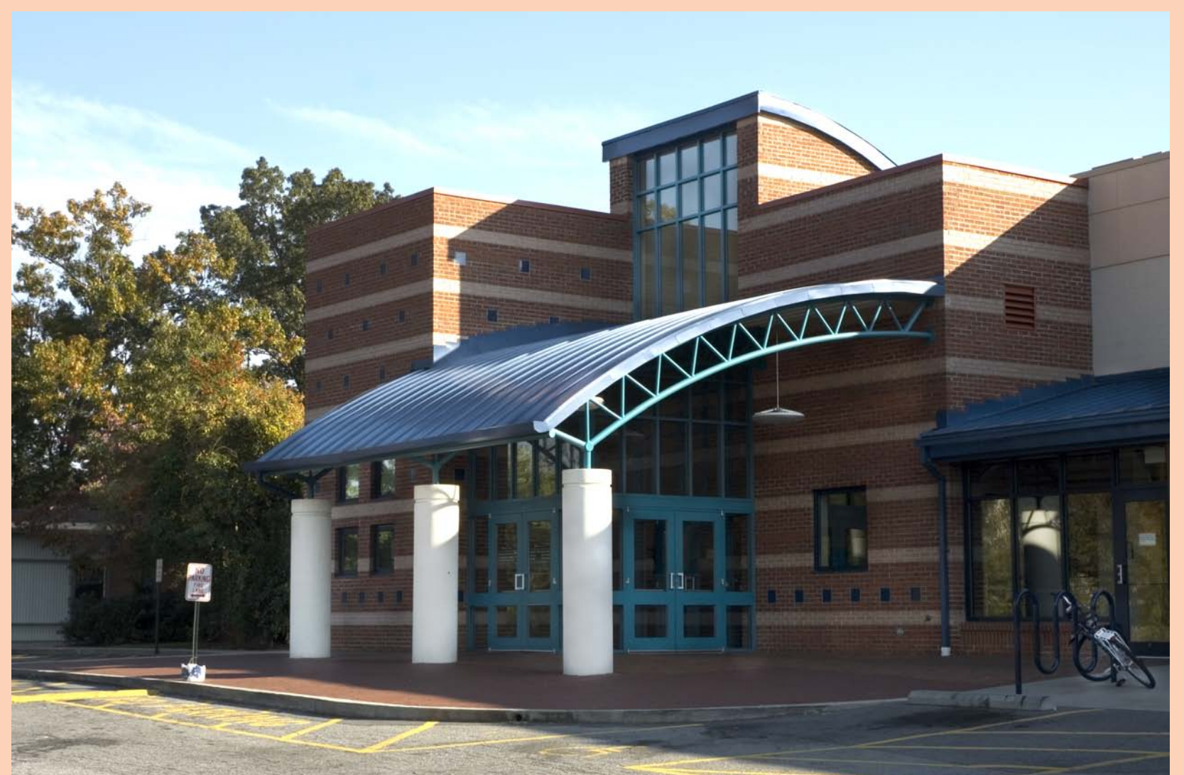
185 S. French Broad Avenue, 2002. The renovation of the YWCA increased the square footage of the building from 23,999 to 38,437. [0755] YWCA Collection, D.H. Ramsey Library, Special Collections, UNC Asheville 28804.

eliminating racism empowering women ywca