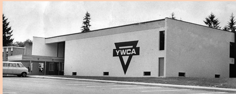
185 S. French Broad Avenue, 1970s.