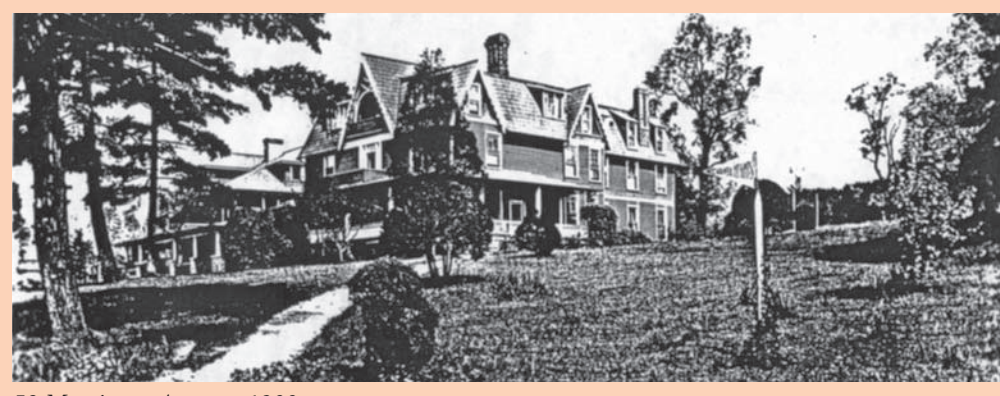
52 Merrimon Avenue, 1900s

Their efforts culminated in 1906 with the purchase of the Patton mansion named "The Henrietta." In 1920 the YWCA boarding house moved briefly to the Cherokee Inn on the corner of Woodfin and Oak and then to the Platt House on 52 Merrimon Avenue. In each of these locations, the focus of the Young Women's Christian Association (YWCA) was to provide dormitory rooms for young women coming to Asheville to find work.