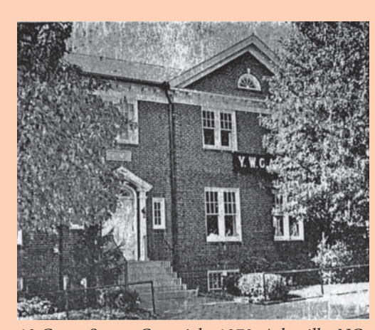
13 Grove Street. Copyright 1970, Asheville, NC Citizen-Times. Reprinted with permission.

to offer girls and women of Asheville the best "spiritual, educational, recreational, and physical opportunities," and included a gymnasium, locker room, several classrooms for meetings or activities,