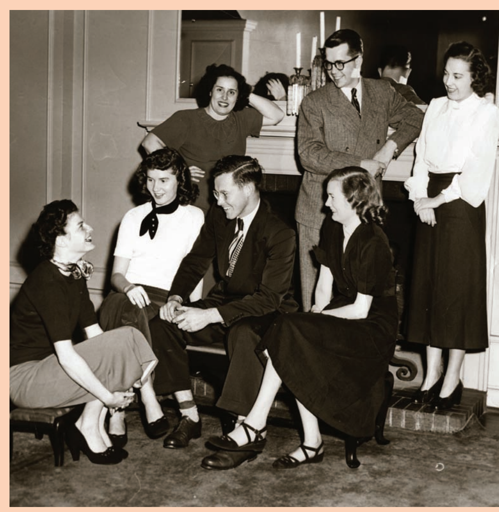
YWCA Moorhead House, 23 Grove Street, 1949. "This was to serve as a lounging place for members, out of town tourists and country folks shopping for the day" (Asheville, NC Citizen-Times). [0557] YWCA Collection, D.H. Ramsey Library, Special Collections, UNC Asheville 28804.

In the late 1960s, the National YWCA communicated to the YWCA of Asheville board of directors that it did not support renovating the Grove Street facility due to the high cost of the needed improvements. The board suggested that Grove Street merge with the Black South French Broad Avenue branch. After much discussion and controversy, the YWCA board voted in 1970 to close 13 Grove Street and consolidate all YWCA services, and move to 185 South French Broad Avenue.