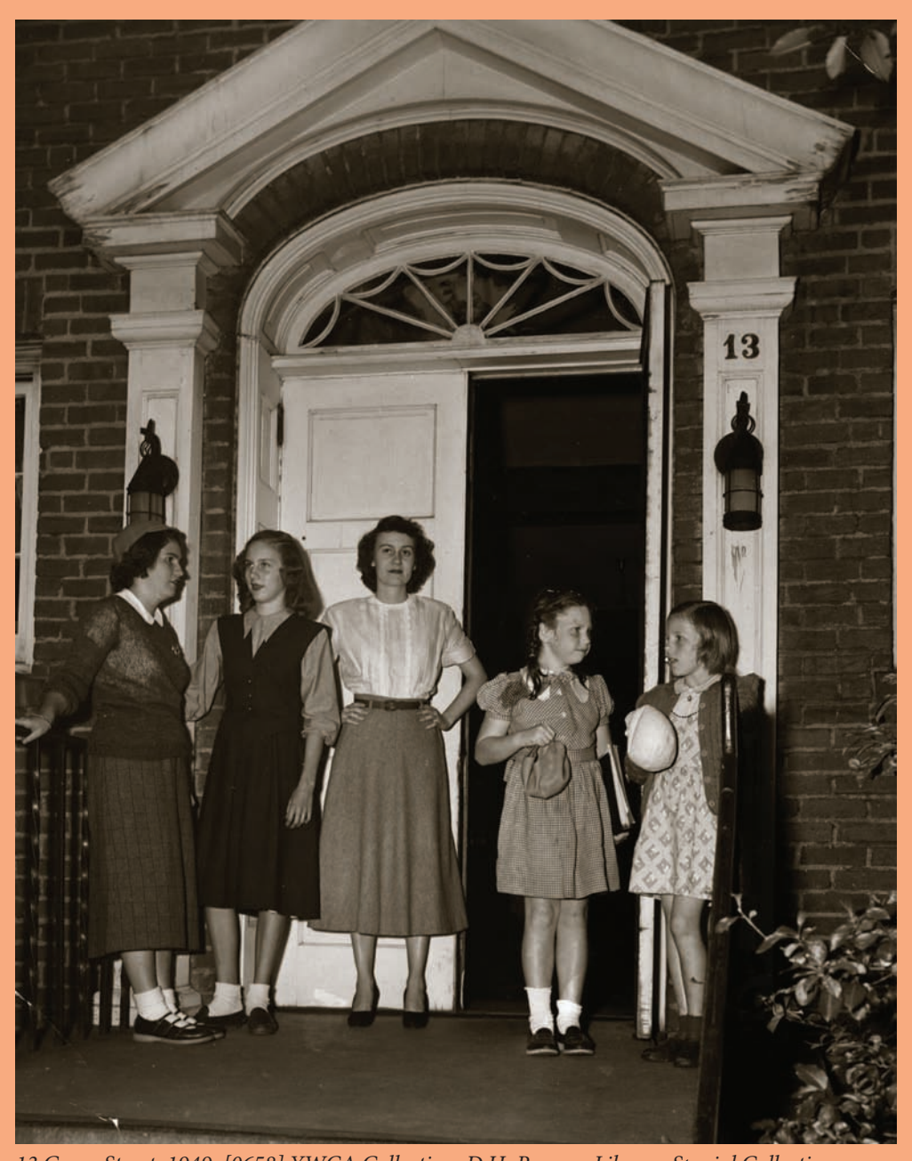
13 Grove Street, 1949. [0658] YWCA Collection, D.H. Ramsey Library, Special Collections, UNC Asheville 28804.

The Grove Street facilities served as the Central YWCA of Asheville for several decades. From dances and vocational discussions to community meetings and swim meets, thousands of women saw the YWCA on Grove Street as their place to connect, learn, exercise, and serve.