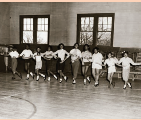
Tap dancing at Phyllis Wheatley branch, 1950s. [0644] YWCA Collection, D.H. Ramsey Library. Special Collections, UNC Asheville 28804.