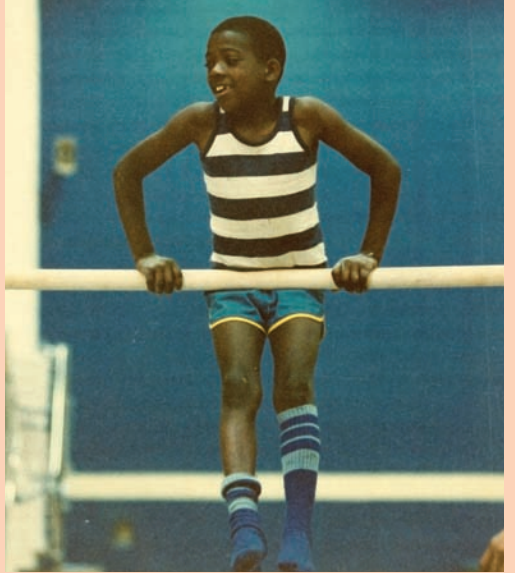
Gymnastics, 1980.

addressing the racial health disparities that exist in our community. In the mid-1990s, the YWCA joined forces with Mission Hospitals and other community organizations to