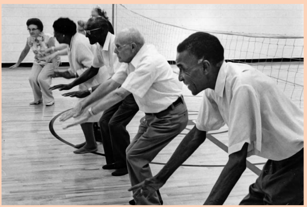
Seniors exercise at the YWCA, 1970s.

it constructed 13 Grove Street to offer girls and women of Asheville the best spiritual, educational, recreational, and physical opportunities. The gymnasium gave girls and women a place to play basketball, volleyball, badminton, and other recreational games. The earliest YWCA programs for young girls such as Camp