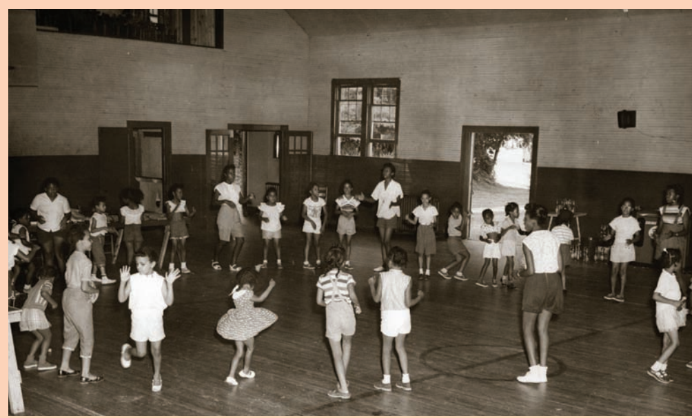
Children's games at the Phyllis Wheatley branch, 1955.

soccer. Well before the beginning of the fitness movement of the 1970s, the YWCA was offering exercise classes and even had an early fitness center called "The Sleek Salon." In 2002, Club W: The YWCA Health & Fitness Center was opened, and at the same time, physical activity was also integrated into youth and childcare programs.