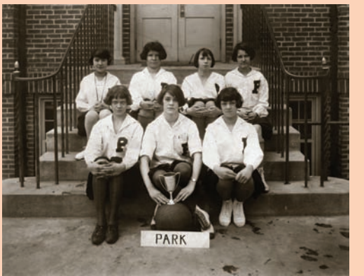
Park Girls Basketball Team, 1920s. [0613]YWCA Collection, D.H. Ramsey Library, Special Collections, UNC Asheville 28804.

Kenjocketee and Girl Reserves included physical and recreational activities as central elements.