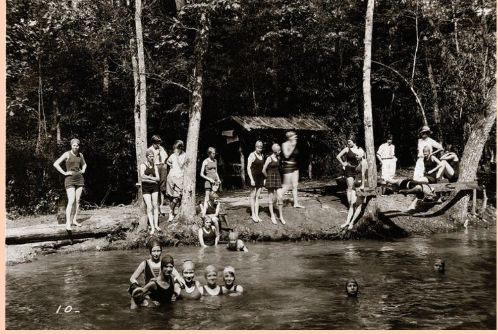
Camp Kenjocketee, 1920s.

From its inception, the YWCA of Asheville has been committed to the physical health of the women it serves. Early on the YWCA leadership at both the Central YWCA and the Phyllis Wheatley branch understood the relationship between a woman's wellbeing and physical activity.